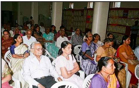
Audience attending Camp