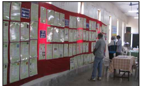
Exhibition : 'Cancer - Ayurved'